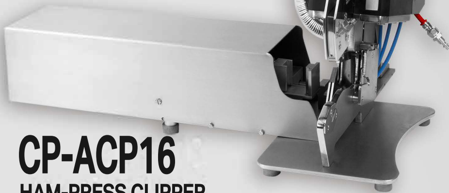
CP-ACP16 HAM-PRESS CLIPPER